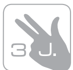
3 YEARS' GUARANTEE