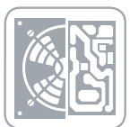
GFK CORD BOARD