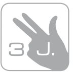
3 YEARS' GUARANTEE