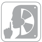
SILENT WINGS FAN