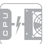
ATX12V VERSION 2.2