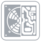
GFK CORD BOARD